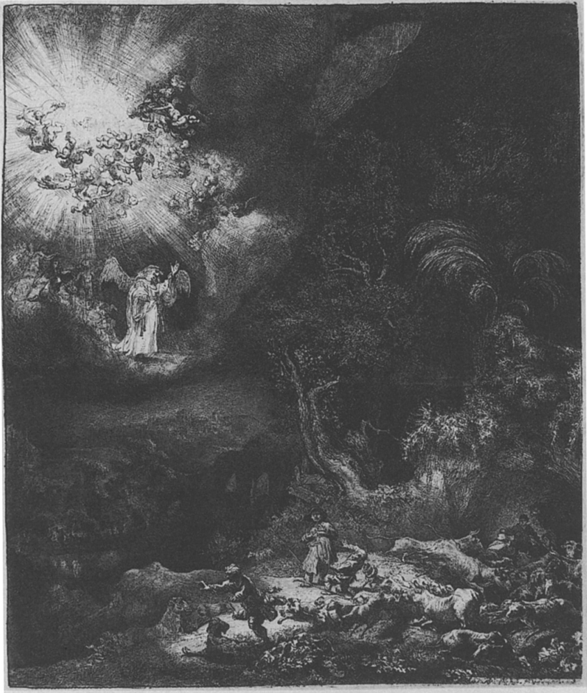
4. 'The Angel Appearing to the Shepherds' , Rembrandt (Fitzwilliam Museum, Cambridge).